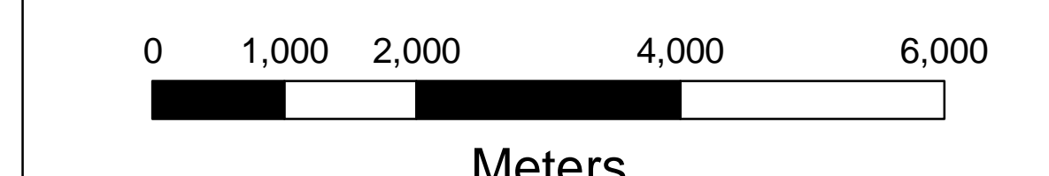
FIGURE 1-1 DRAWN BY: D. HESS DATE: Aug 27/08

INFRASTRUCTURE SERVICES & COMMUNITY SUSTAINABILITY INFRASTRUCTURE SERVICES INFRASTRUCTURE MANAGEMENT INFRASTRUCTURE APPLICATIONS