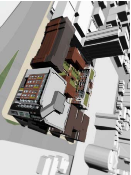
northeast aerial view