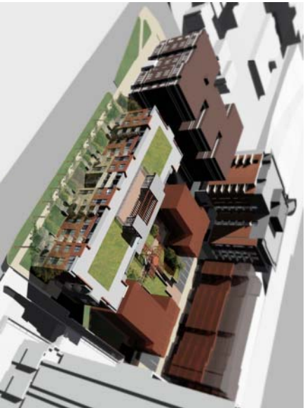
southwest aerial view