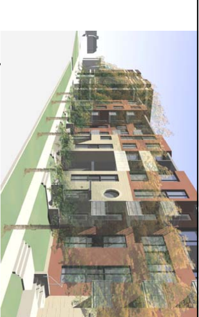
argyle street view