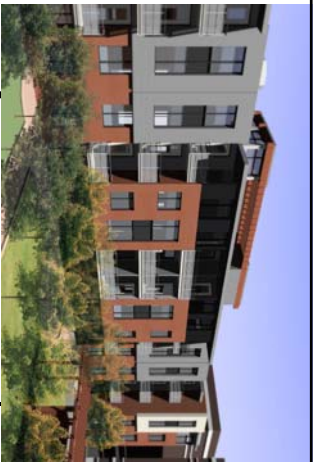
view from community garden