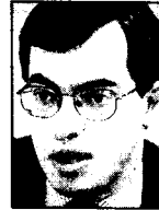
TONY CLEMENT Cool to idea

In 110 hours of operation, the camera at Dufferin St. and St. Clair Ave. caught 301 eastbound cars running red lights for an average of 65 eastbound cars per