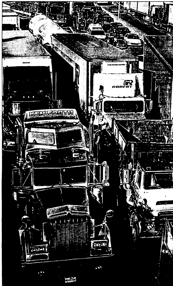
Proposed new rules for U.S. truck and bus operators will set weekly workload maximums that are 24 to 36 hours a week less than those permitted in Canada. CP

Predictably, the American Trucking Association (representing the larger U.S. transport companies) is crying financial distress over the new U.S. workload limits. Meanwhile, insurance and citizens groups complain that the proposals don't go far enough.