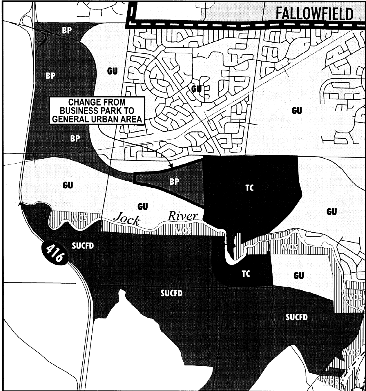
OFFICIAL PLAN - SCHEDULE "B" URBAN POLICY PLAN