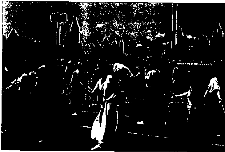
Redeemer's liturgical dancers march for Jesus in Ottawa.

Redeemer School faces financial challenges. Tuition is a set percentage of the parents' income, so tuition income drops when the economy is down (as does financial support from the business community). The school is using all of the facilities that it rents from the local school board and is looking for a larger building. Given its history, this community for Christian learning will find solutions cooperatively.