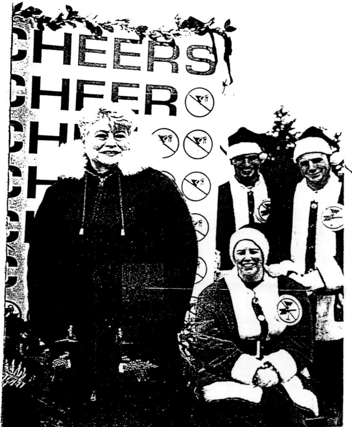
SAN CLAUS ARADE 1997